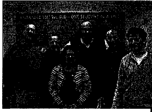
Evangelists-in-training visit Oxford

In February and March of 2008, eight people came to observe and participate in university missions in Oxford and Sheffield. They came from Greece, Bulgaria, Czech Republic, Albania, Serbia, Macedonia and Denmark. We have already heard of the trainees engaging in evangelistic and apologetic talks. For example, in the University of Athens an outreach was held in which the young evangelist applied his new knowledge to give a lunch time talk at the event.