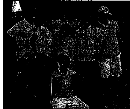
A group from Barbados participated in the Dominica missions outreach

For five days, 37 students and staff from across the Caribbean shared about IFES ministry with a goal of inspiring Christian students to establish a group in their school. Plans are now moving ahead to officially establish an IFES movement there. A teacher has committed to being the Dominican representative while IFES regional staff continue to seek others to commit to the work and while a board and a national body are established.